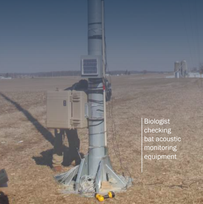
Biologist checking bat acoustic monitoring equipment